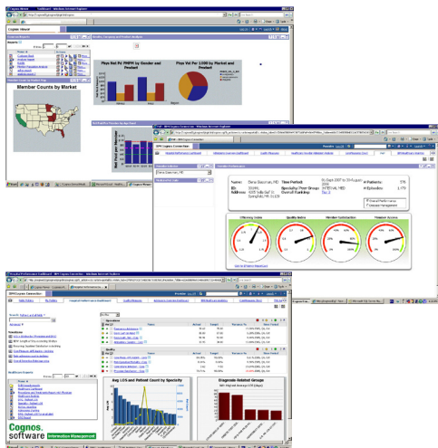
Figure 2: Healthcare organizations deploy dashboards and scorecards to monitor both process and performance.

With dashboards, managers can drill into or through related reports and other data sources (for example, OLAP cubes) to explore and understand the trends and issues affecting performance at the operational level. If for example, a service line manager's financial team reports that volumes or margins are falling out of acceptable range – or if quality metrics are trending in the wrong direction – managers can click into the data to understand why. In the first example, it may be that a key referring physician has changed schedules. In the second example, the trend may be identified across different shifts or certain procedures, providing more insight to care teams. In both of these cases, data from the operational dashboard prompts a frontline manager to act and spurs a higher-level manager to explore a broader data set to identify the root causes and make the needed adjustments.